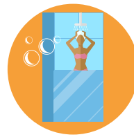
Leave-on or Rinse-off products